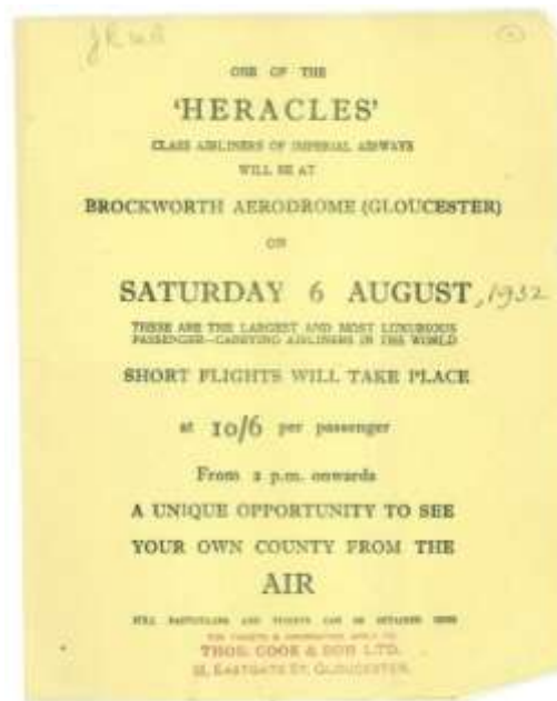
Gloucestershire Archives JR14.18GS

After the civic dignitaries had been flown, Heracles began making short flights for the public – who were now gathering in their hundreds. These flights had been advertised at Thomas Cook in Gloucester (see picture below) and were all pre-booked at a cost 10s/6d (about a day's wages for a skilled tradesman). The Gloucester Journal reported that it was an ideal day for flying, with little wind and that the aircraft ' flew as high as 2,000 feet! ' Eventually the critics returned to Brockworth (they panned Shaw's play) and G-AACX departed to return to Croydon.